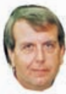
Rees Day, KY